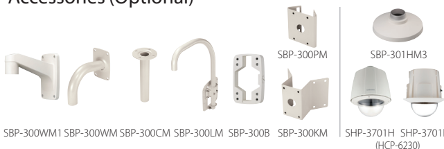
SBP-300WM1 SBP-300WM SBP-300CM SBP-300LM SBP-300B SBP-300KM SHP-3701H SHP-3701F (HCP-6230)